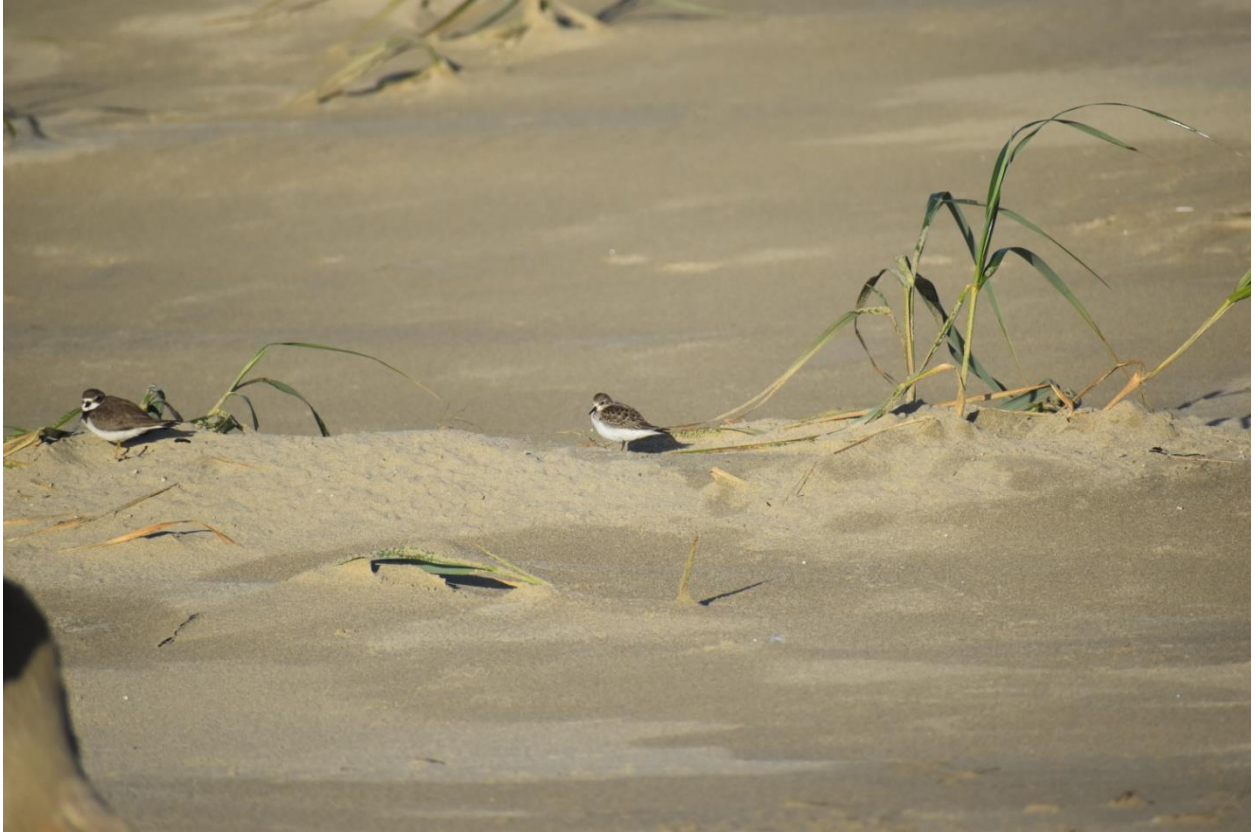
RNST-2023-25h on 3 Oct 2023