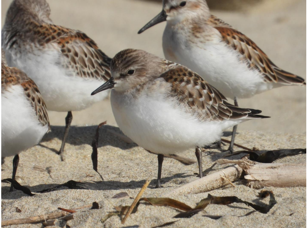
RNST-2023-25w, photo taken by Colby Neuman on 1 Oct 2023