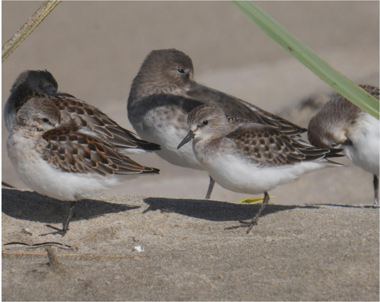
RNST-2023-25t, photo taken by Kevin Scaldeferri on 3 Oct 2023