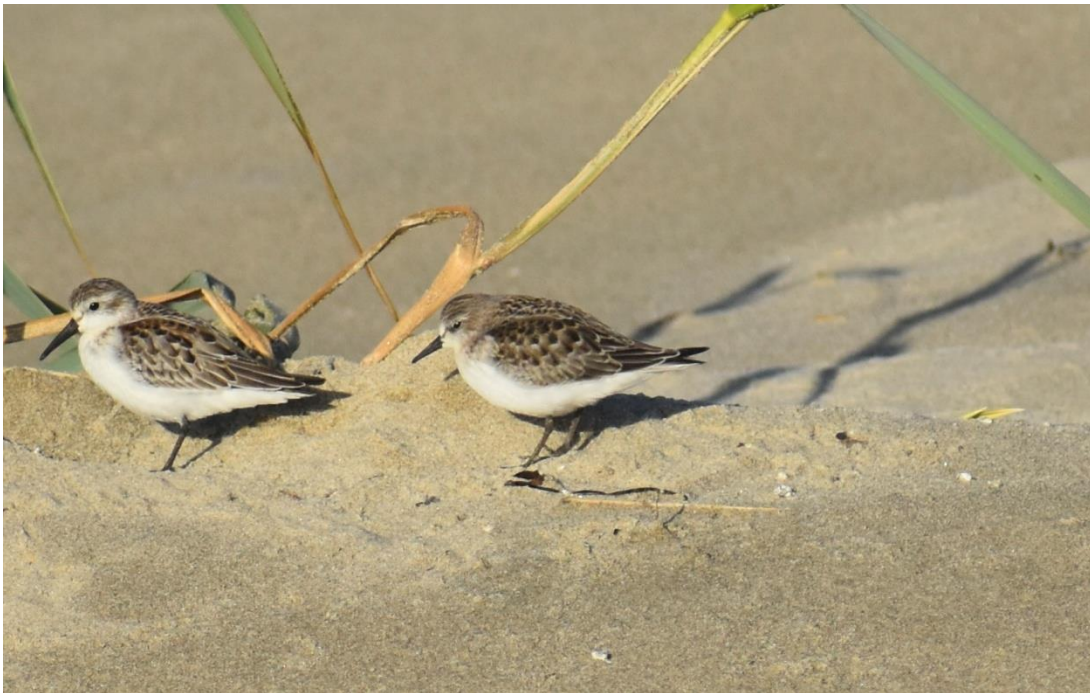
RNST-2023-25l, cropped photo taken by Aaron Beerman on 3 Oct 2023