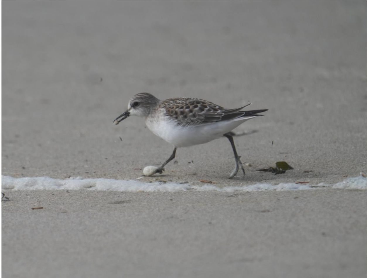
RNST-2023-25q, photo taken by Kevin Scaldeferri on 3 Oct 2023