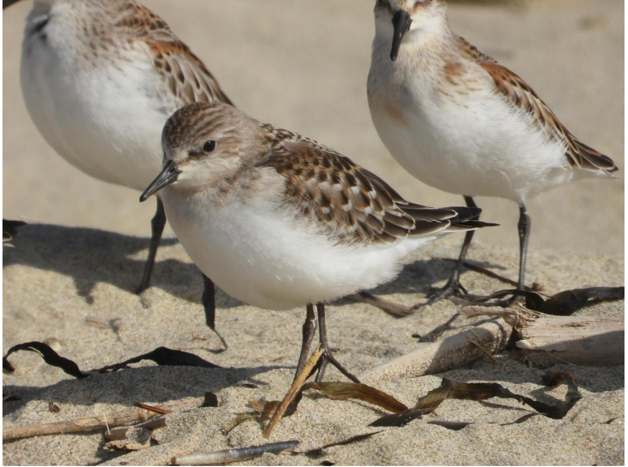
RNST-2023-25x, photo taken by Colby Neuman on 1 Oct 2023