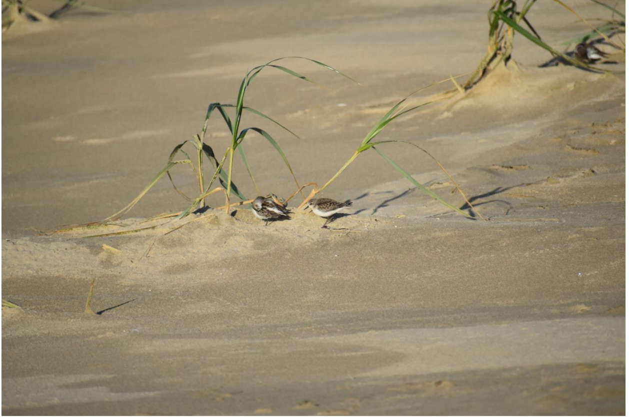
RNST-2023-25k, photo taken by Aaron Beerman on 3 Oct 2023