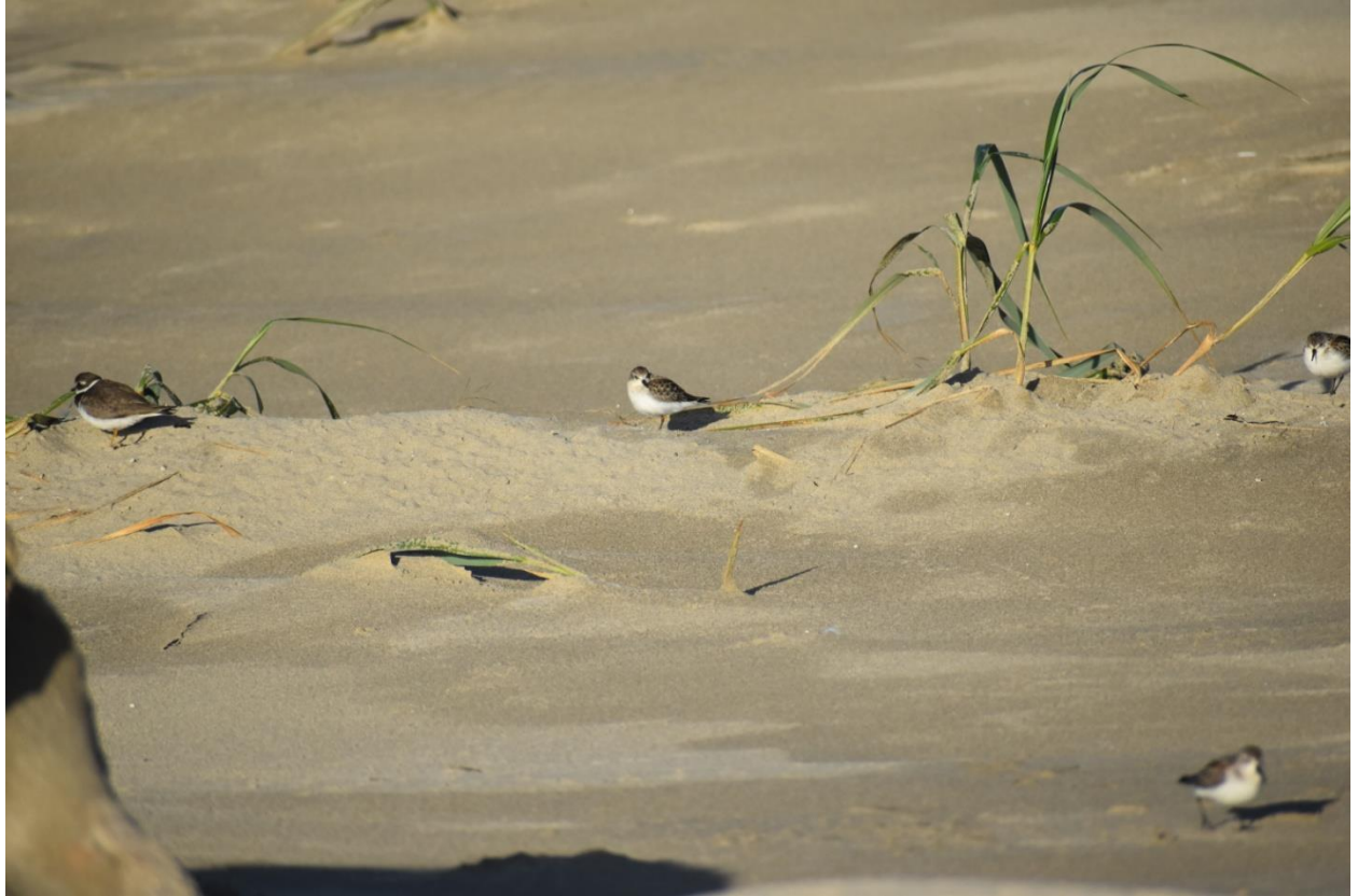
RNST-2023-25d, photo taken by Aaron Beerman on 3 Oct 2023