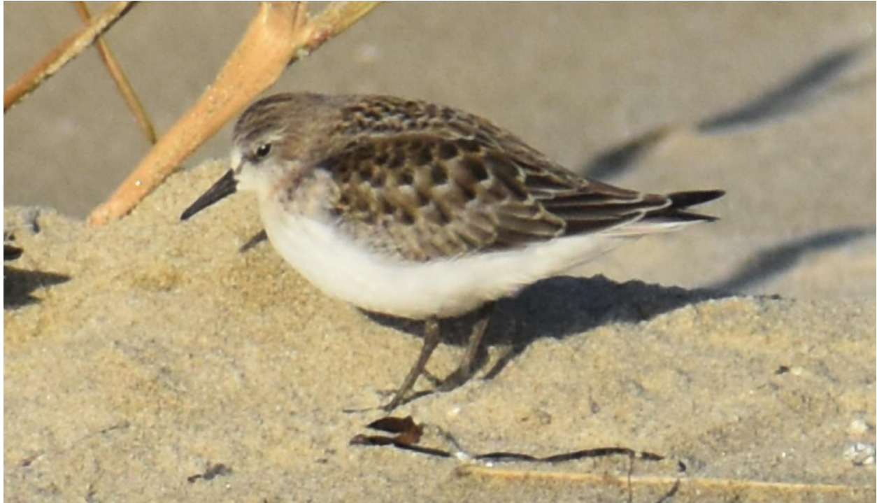
RNST-2023-25l, second cropped photo taken by Aaron Beerman on 3 Oct 2023