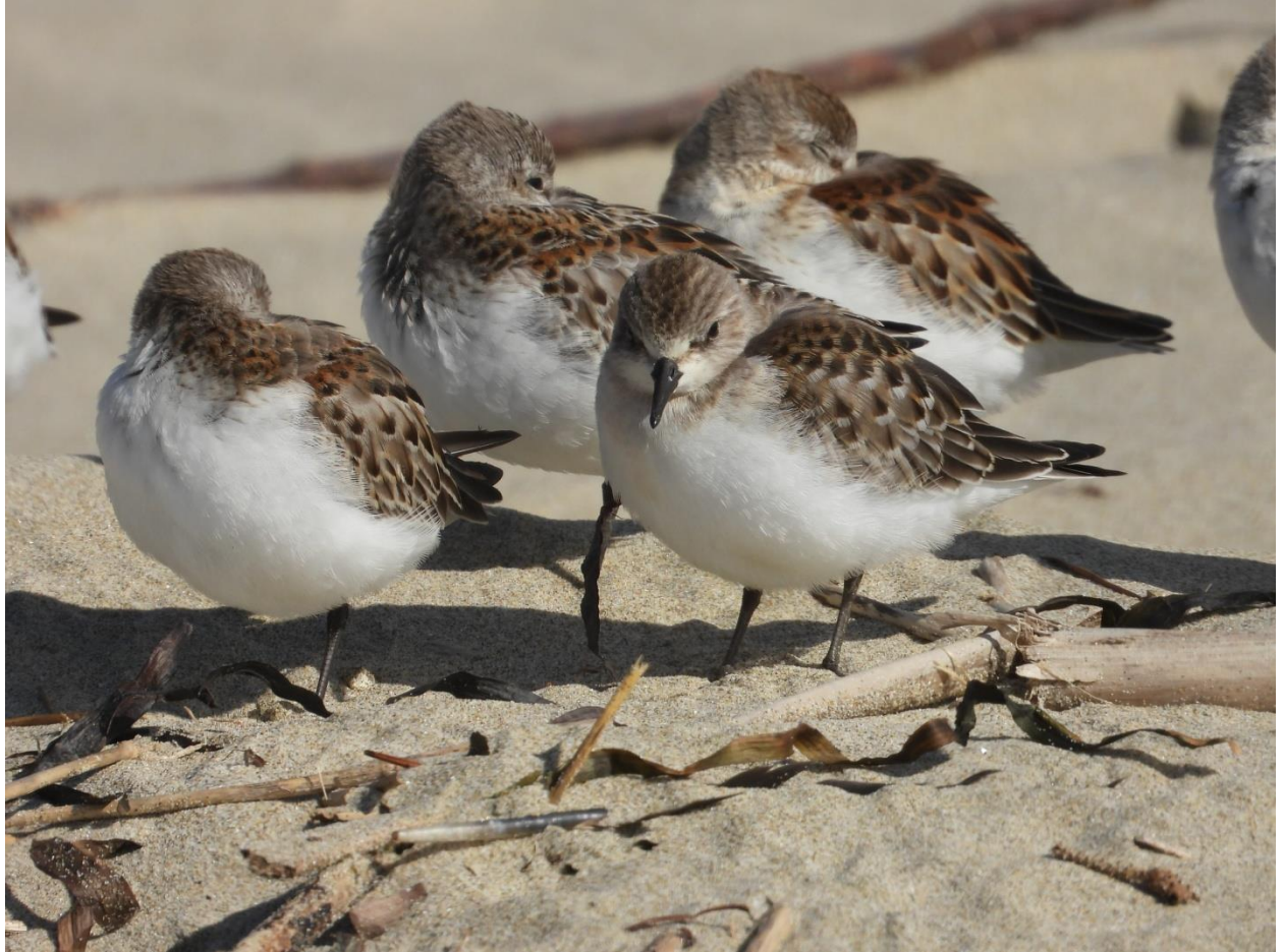
RNST-2023-25u on 1 Oct 2023