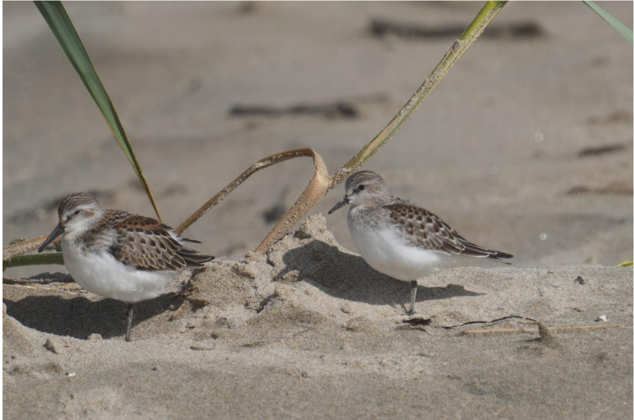
RNST-2023-25r, photo taken by Kevin Scaldeferri on 3 Oct 2023