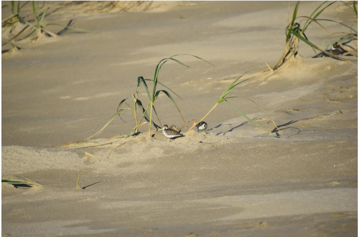
RNST-2023-25j, photo taken by Aaron Beerman on 3 Oct 2023