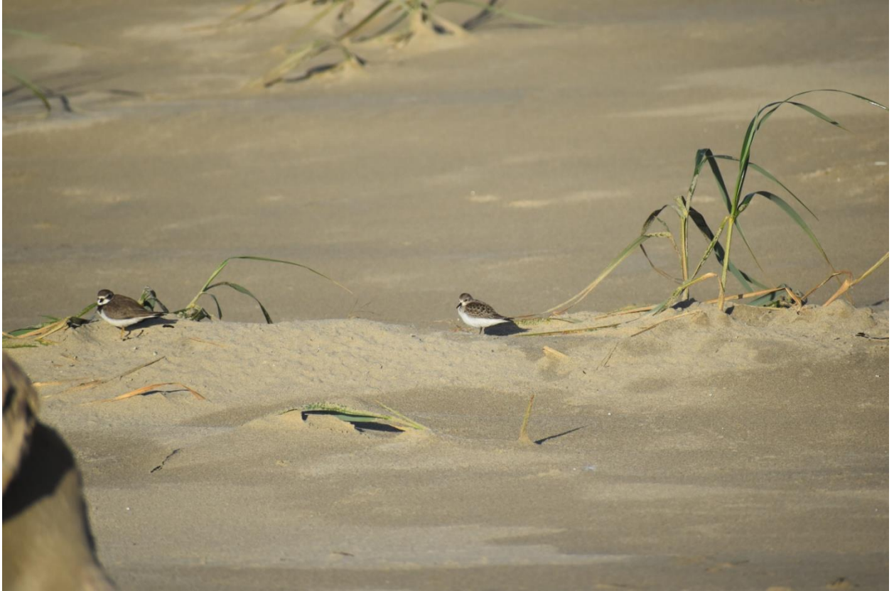
RNST-2023-25g on 3 Oct 2023