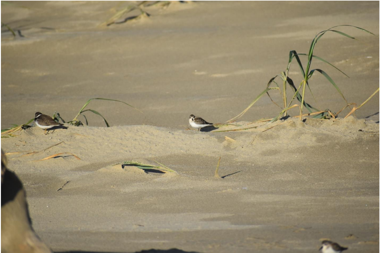
RNST-2023-25e, photo taken by Aaron Beerman on 3 Oct 2023