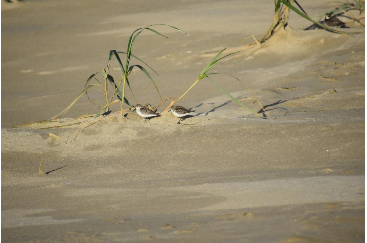
RNST-2023-25l, photo taken by Aaron Beerman on 3 Oct 2023