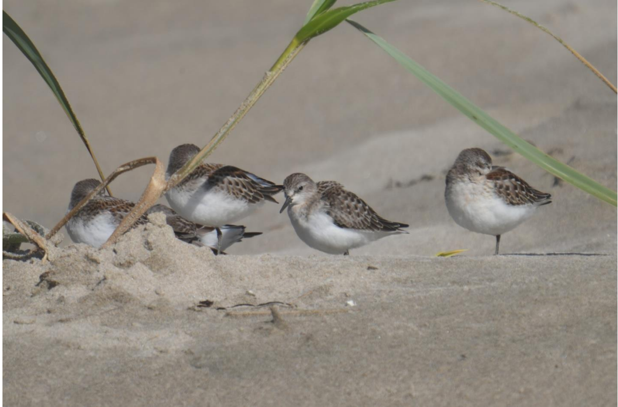
RNST-2023-25s, photo taken by Kevin Scaldeferri on 3 Oct 2023