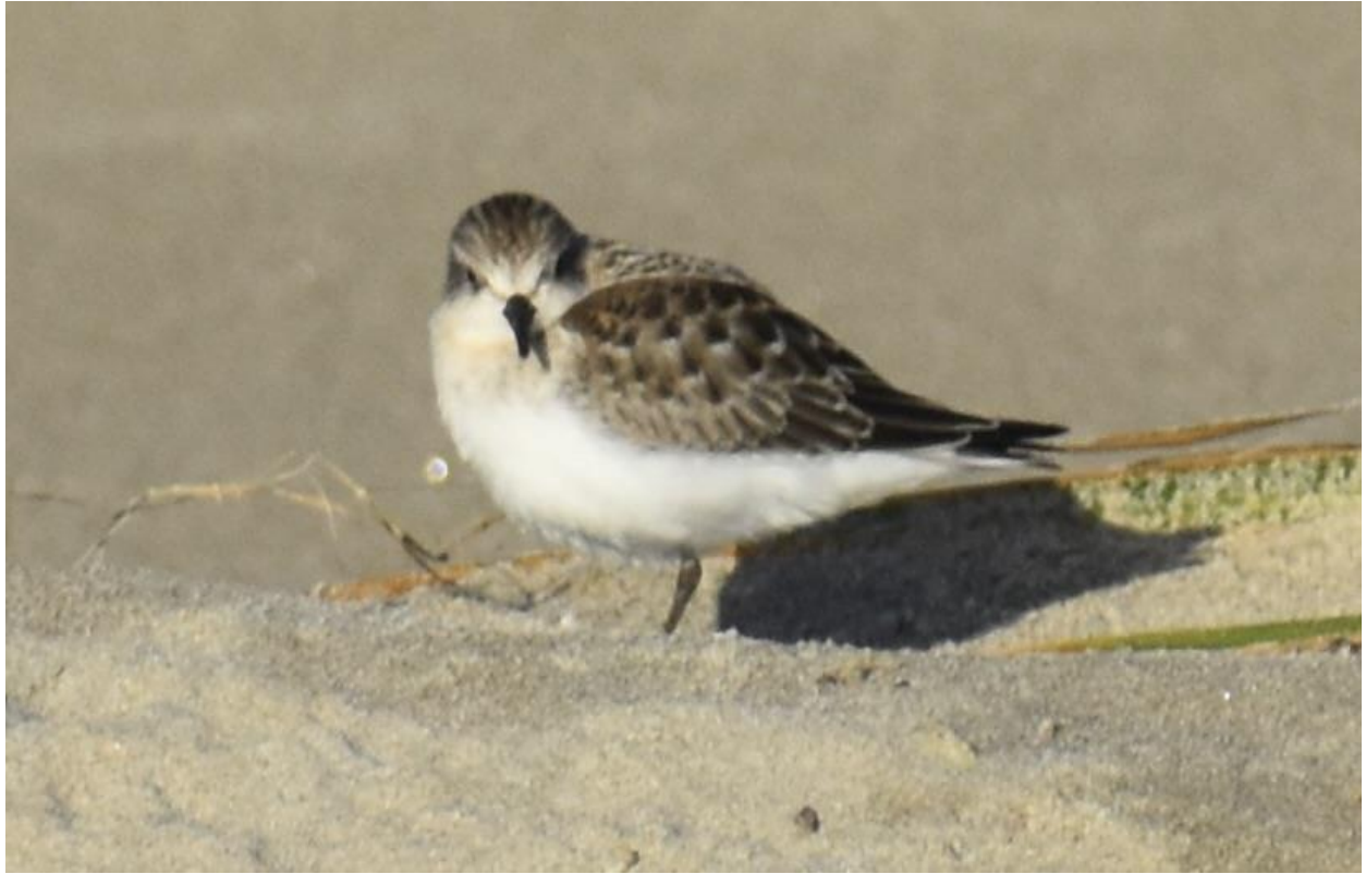
RNST-2023-25e, cropped photo taken by Aaron Beerman on 3 Oct 2023