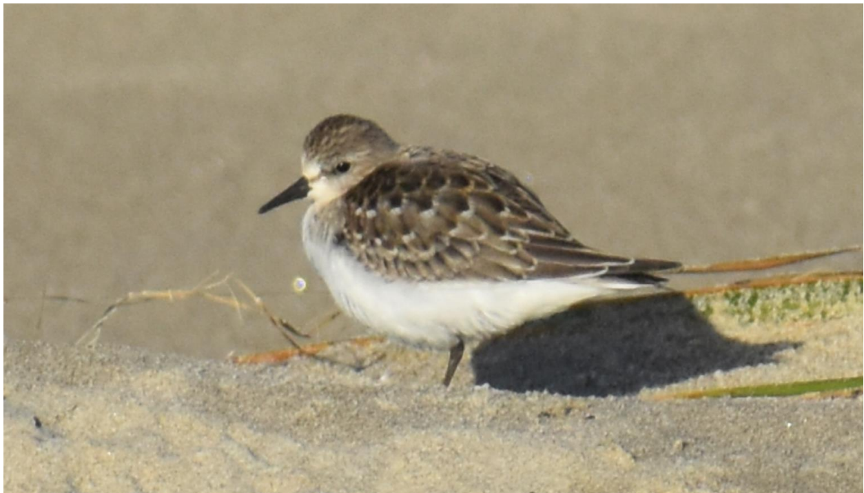
RNST-2023-25m, cropped photo taken by Aaron Beerman on 3 Oct 2023