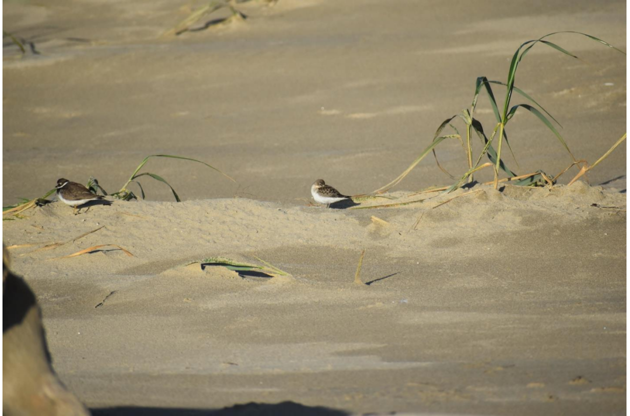
RNST-2023-25f, photo taken by Aaron Beerman on 3 Oct 2023