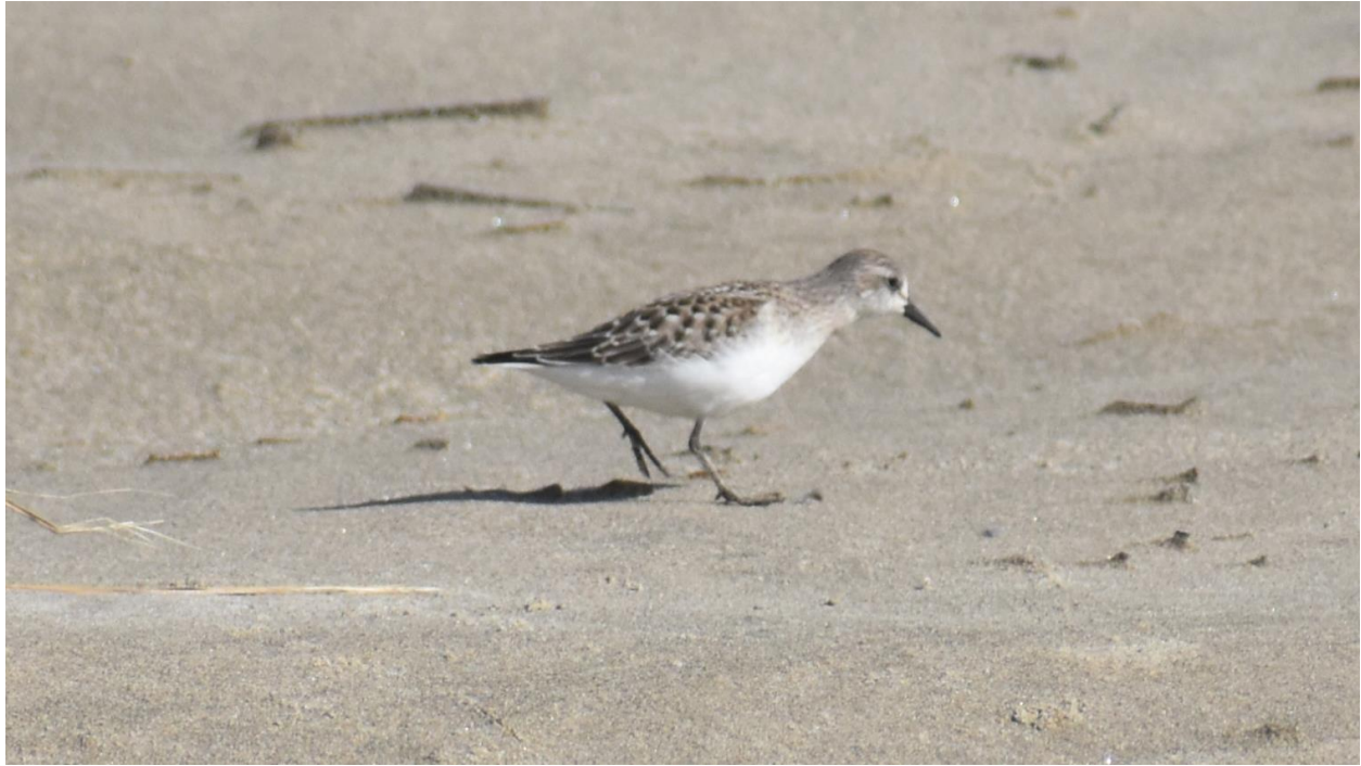
RNST-2023-25n, photo taken by Aaron Beerman on 3 Oct 2023