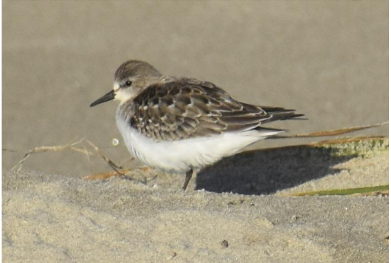
RNST-2023-25j, cropped photo taken by Aaron Beerman on 3 Oct 2023