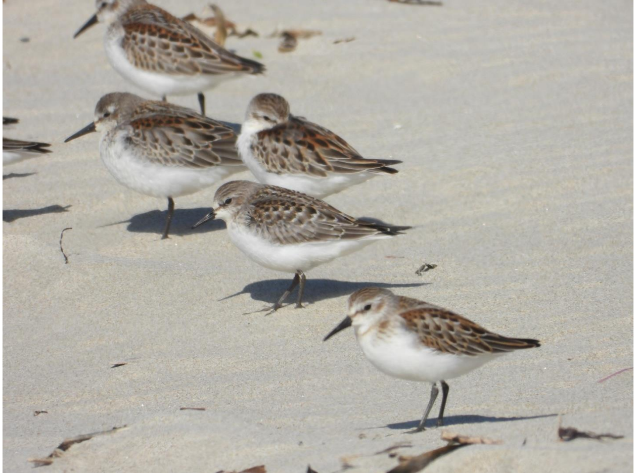
RNST-2023-25v, photo taken by Colby Neuman on 1 Oct 2023