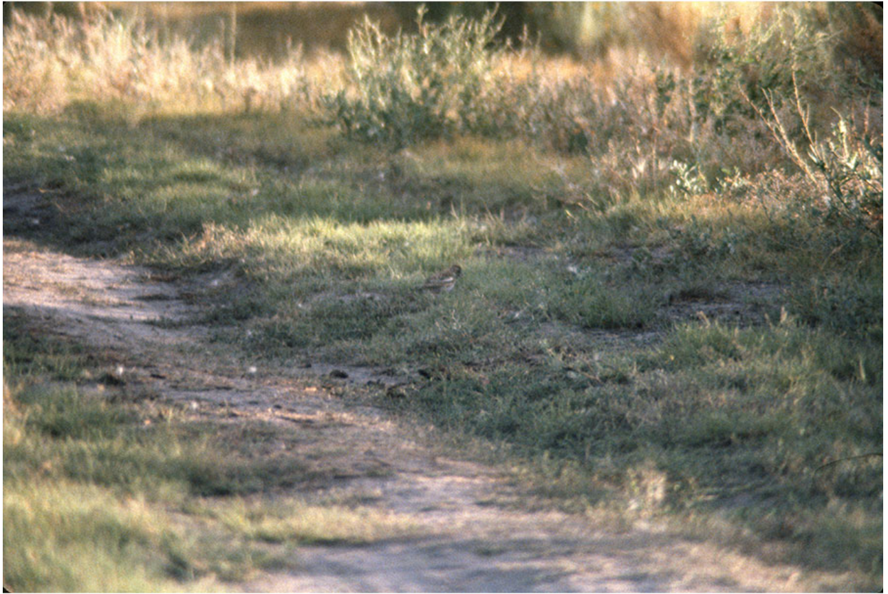
Lark Bunting 605-83-05