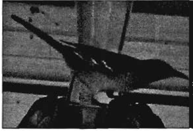
Hooded Oriole at the Alvord Inn, Fields. Photo by David Vander Pluym

505-10-35 Bandon, Coos Co., 1 bird 14-15 October 2010 (photos by RuN).