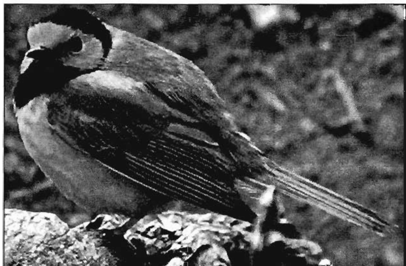
Hooded Warbler at Fields.

074-07-10 N. Spit Coos Bay, Coos Co., 1 bird on 30 May 2007 (DLA).