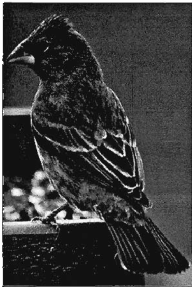
Blue Grosbeak, Hatfield MSC, Lincoln Co.

537-08-04 N. Spit Coos Bay, Coos Co., 1 bird on 30 October 2008 (DLa, KC, RuN).