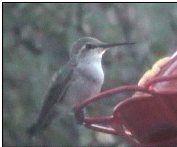
Female Costa's Hummingbird, Bend, Deschutes Co., 28 August 2000

**New to the all time contributors list.