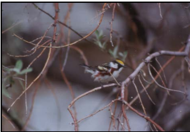
Chestnut-sided Warbler, Malheur Field Station, 29 May 1999 (another view of 659-99-37)