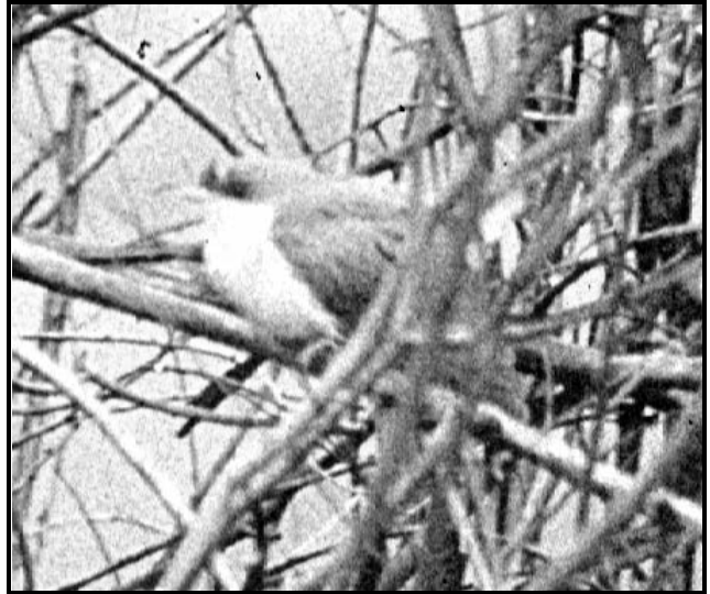
Yellow-billed Cuckoo (354-98-18)