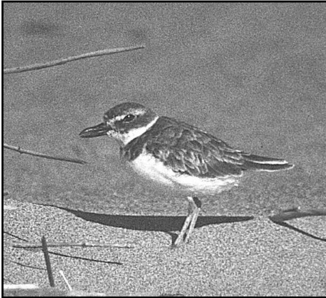
Wilson's Plover

280-98-01 Bullards Beach State Park, Coos Co., 1 bird, 9-17 September 1998 (BT, DLa, PSu, photos by JPi, TJ, HN, CM, CD, OS).